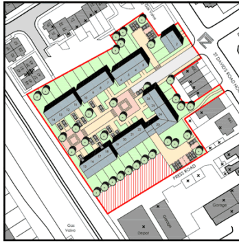
St David's Road Scheme

Explained the background of the Save North Beach Car Park group and that he had been a member since 2005. He noted there was a link between this