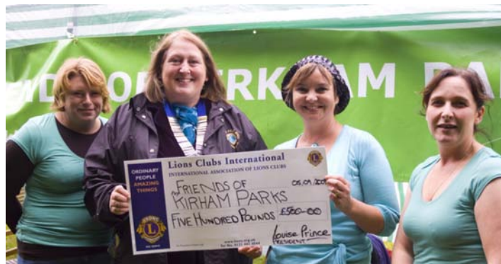
The Kirkham Lions Club presented the Friends of Kirkham Parks with a cheque for £500 at the Friends of Kirkham Parks AGM on 20th September 2009

Since setting up the Friends of Kirkham Parks in January 2009 we have received a great deal of support from many members of the community in and around Kirkham. Here are just a few examples of how people have been contributing their talents and resources to making the dreams of a new park come true: